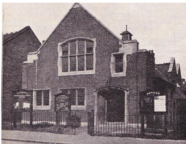
St Cuthbert's District Presbyterian Church in 1937

For the full story of St Cuthbert's, and indeed Trinity, visit the history section of the church website.