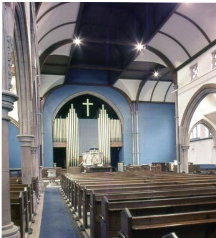
The blue walls