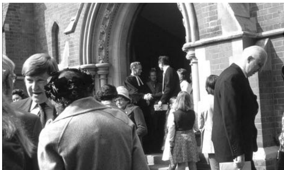
Front cover photo: