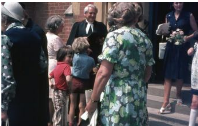
The Minister, Revd H Burns Jamieson, and congregation leaving church after the morning service