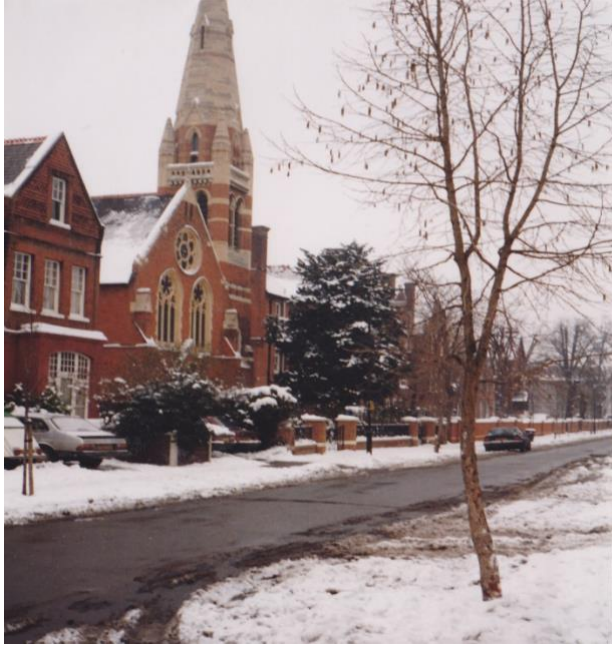
Mansel Road on 9 February 1991