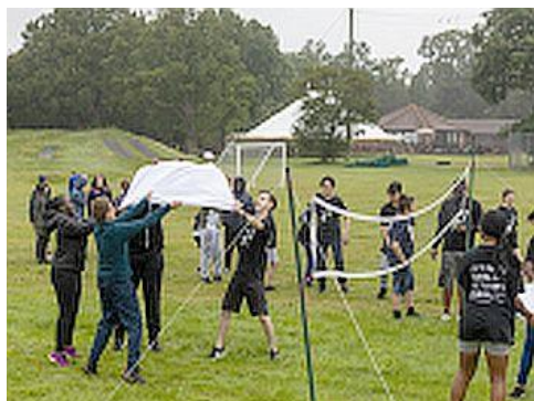
Oakwood Falcon Camp