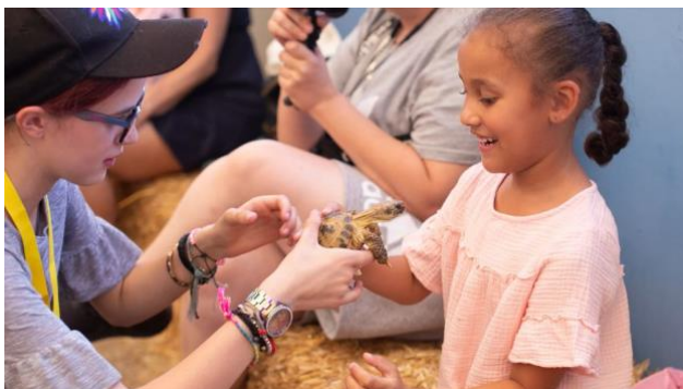
Hounslow Urban Farm

Next Clare had prepared a picnic for everyone in a shady marquee. Then it was time to wander around the farmyard, feed the goats and sheep and meet the rather grumpy alpaca.