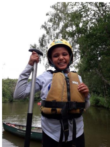
Carroty Wood Falcon Camp