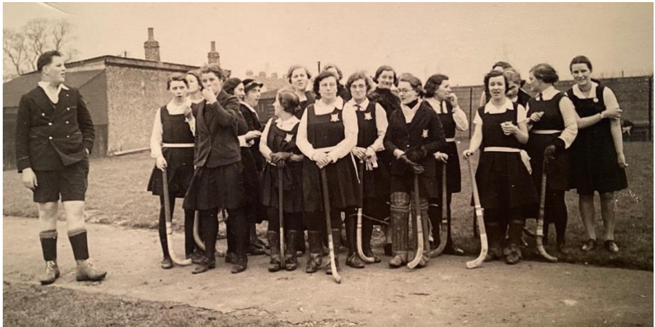
Above: The Trinity and St Cuthbert's teams meet together before the match. Presumably the young man on the left was the referee.

Saturday 17 March 1934 was notable for a number of important sporting events - the Boat Race, international rugby at Twickenham and Chelsea v Sheffield Wednesday at Stamford Bridge. But the Wimbledon Presbyterian suggested that all these 'pale into insignificance when it is remembered that on the same afternoon there took place a struggle for supremacy between St Cuthbert's (Presbyterian Church, Effra Road) Girls Hockey Club and a mixed team representing Trinity, Mansel Road. This local derby took place at Garfield Road Recreation Ground and was witnessed 'by a good crowd which, though not as large as those at Putney, Chelsea and Twickenham, made up in enthusiasm what they lacked in numbers.'