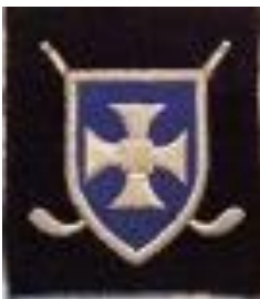
Left: The badge of the St Cuthbert's Girls Hockey Club

For the record, St Cuthbert's led 1-0 at half-time. They then made it four before Trinity pulled one back, causing 'ecstatic joy amongst the supporters whose hats, sticks and umbrellas went up into the air'. Unfortunately, St Cuthbert's scored twice more to finally win 6-1.