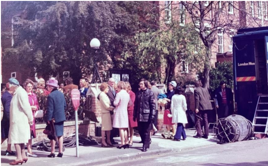
The congregation leaving the Church after the service. On the right is an LWT van