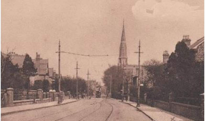
Worple Rd with the Congregational church spire - looking towards Elys corner