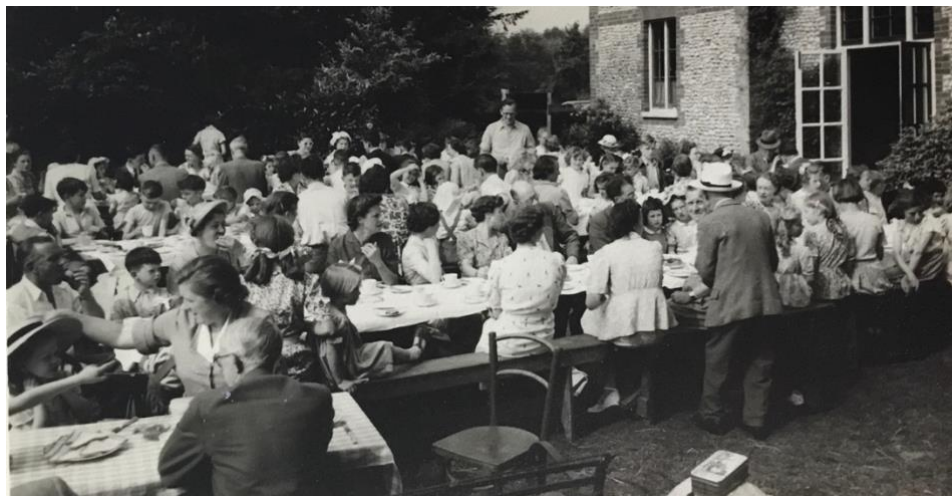
1952 a big tea party during an outing to Ranmore Common

Bushy Park was visited several times. In the after-War years, Polesden Lacey, the National Trust property near Bookham, was visited eight times. Races were run and other sports and games were organised. Friends came in time for tea together - in those days the Trust didn't charge for admission. The weather only occasionally remembered that it was midsummer, but these were great Trinity occasions. During the 1950s, Virginia Water was twice the chosen place.