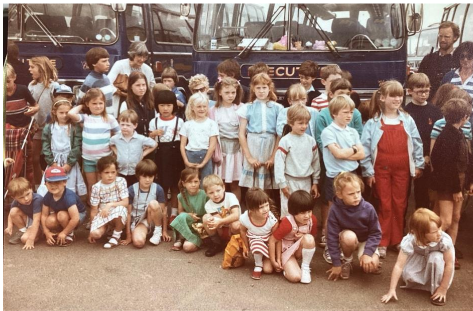
1984 A special outing to Thorpe Park to celebrate the Sunday School's centenary.

In later years Godstone Farm became the annual scene of our Junior Church outings. At first a coach was hired but, later, families and others came by car, giving greater freedom to come and go. But everybody met together for lunch, and the open fields and the farm animals and other livestock were a popular attraction for young and old.