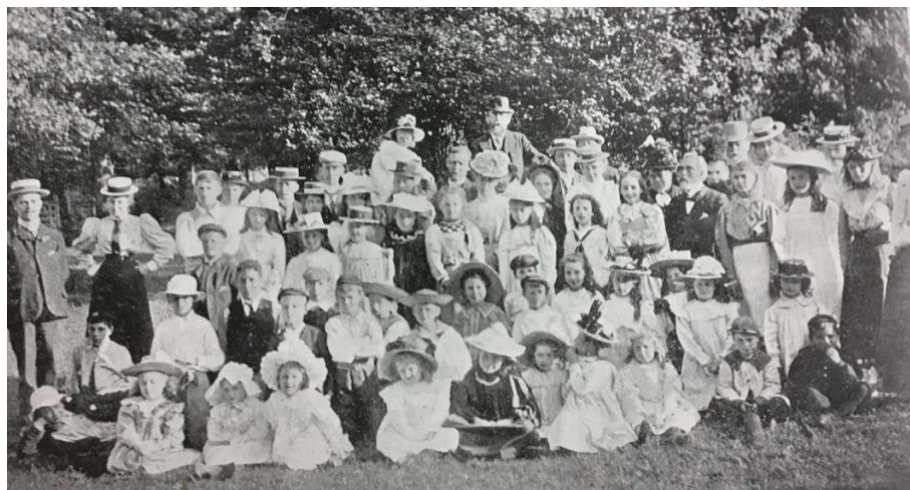
1901 at Ravensbury Park Farm

"The children left Wimbledon in brakes and arrived at Chessington soon after midday. The drive through the pretty country lanes, to say nothing of the excitement of crossing two fords, proved no small part of the day's enjoyment.