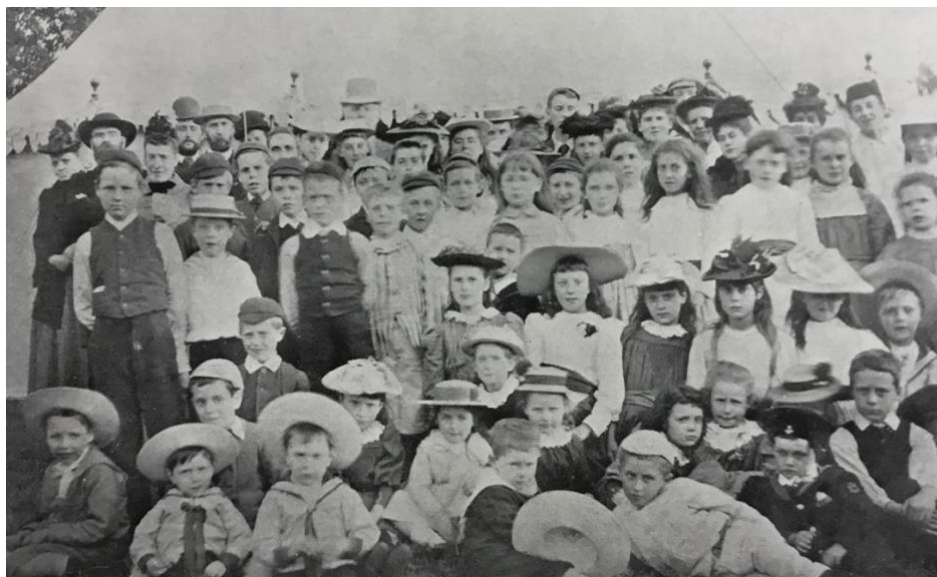
1892 outing in the meadow at Crooked Billet

Midsummer! Traditionally, in Trinity and other churches, the time for Sunday School and Junior Church outings, or 'treats' as they were known in the early days. This was the time when, hopefully in fine summer weather (although this didn't always work out!), the children were given a happy day out together in the open air, sometimes with an exciting journey to and from the chosen site.